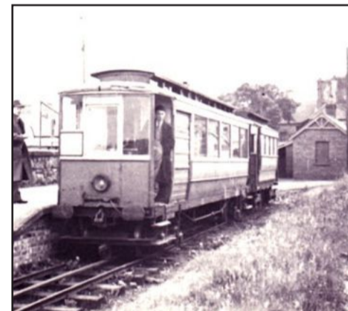
Bessbrook to Newry tramway.

It was not until 1899 that these merchants decided to support a local exchange, but they were hampered in two respects by the Post Office which had become the monopolist: not providing a connection to the Belfast - Dublin trunk line nor permitting connections on the County Armagh side of the town. Eventually an exchange was established in a ladies' clothes shop at Number 2 Kildare Street, and a connection was made to the trunk lines upon a financial guarantee from the National Telephone Company to the Post Office. The Newry Reporter was an early subscriber being allocated the phone number 2 and a prominent trader in the town, J.J. McArvey advertised as "Telephone: 1X, Newry"