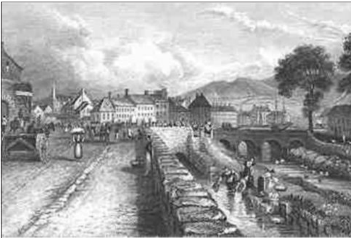
Newry Canal was the source of prosperity.